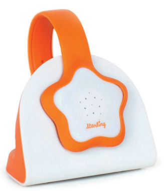
Starling Device > The Starling device is a small monitor that attaches to a child's clothing.

For more information on the CP Birth to School initiative, please visit www.cps.k12.in.us/domain/1351