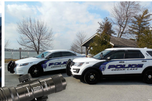
^ Streamlight Weapon Light The Streamlight Weapon Light attaches to the Police Officer's patrol rifle.