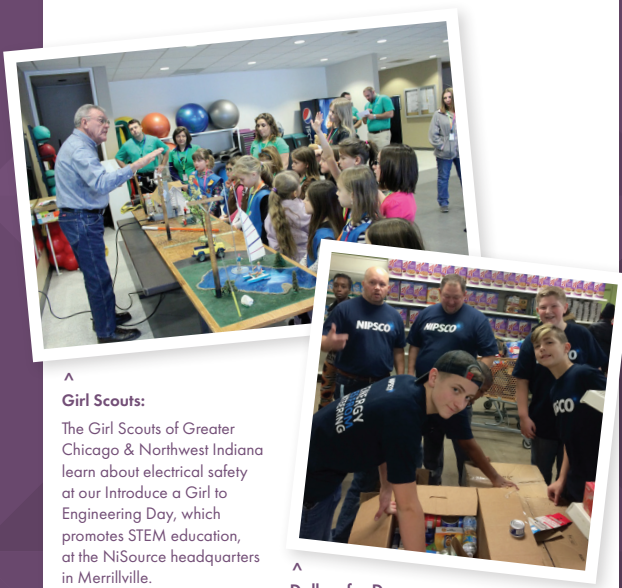
Girl Scouts: The Girl Scouts of Greater Chicago & Northwest Indiana learn about electrical safety at our Introduce a Girl to Engineering Day, which promotes STEM education, at the NiSource headquarters in Merrillville.

MISSION: NIPSCO has served the energy needs of northern Indiana for more than 100 years. Community support and involvement has always been at the foundation of our history. We're also making significant investments to improve service, including nearly $30 billion in identified long-term system modernization and growth programs spanning the next 20+ years.