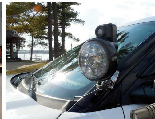
^ Noptic Thermal Imaging Cameras The cameras assist in search and rescue operations as well as law enforcements.