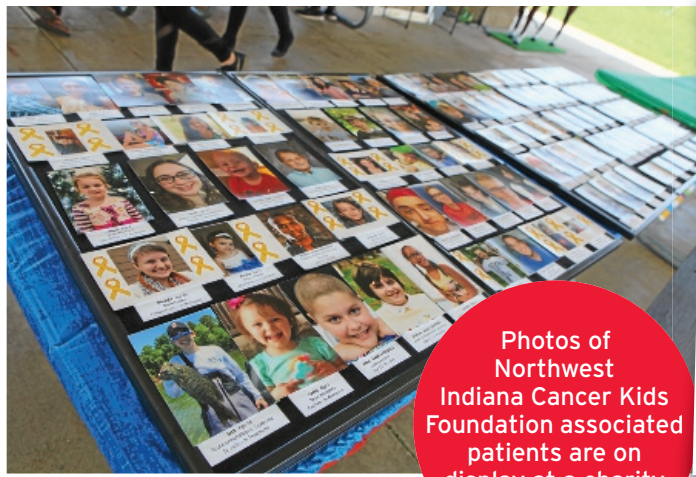
Photos of Northwest Indiana Cancer Kids Foundation associated patients are on display at a charity event.