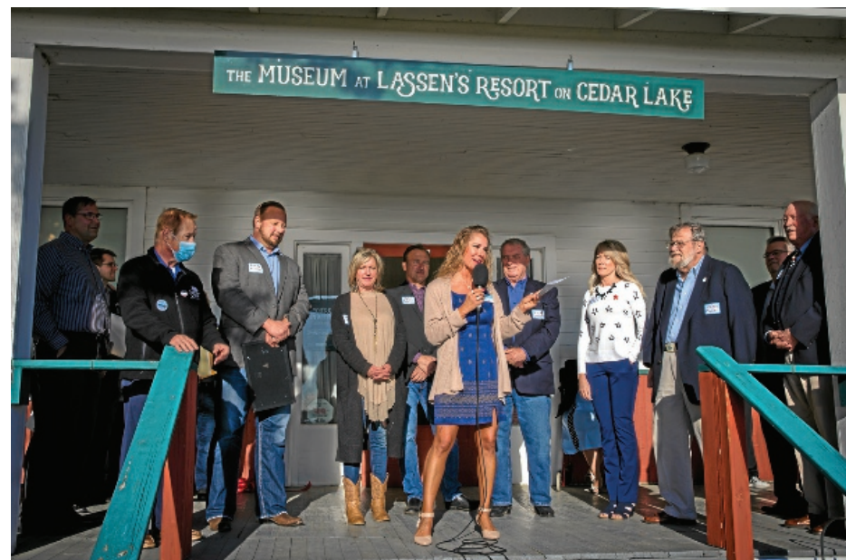
Several members of the Cedar Lake Historical Association stand on the porch of Lassen's Resort during the grand opening of the new Cedar Lake Historical Museum.

fundraisers again with the next one being a St. Baldrick's event March 13 at the International Union of Operating Engineers Local 150 Hall in Merrillville. Details can be found on the organization's website, nwicancerkids.org , and Facebook page, www.facebook.com/NorthwestIndianaCancerKidsFoundation . “We are lucky to have people in the