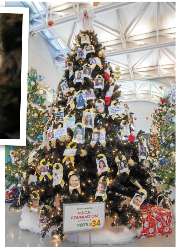
The NICK Foundation has sponsored a tree featuring kids it has helped at the Indiana Welcome Center in Hammond.