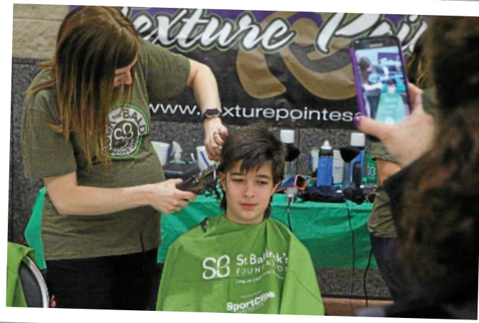
The Northwest Indiana Cancer Kids Foundation has scheduled its St. Baldrick's event to raise funds for kids with cancer March 13.