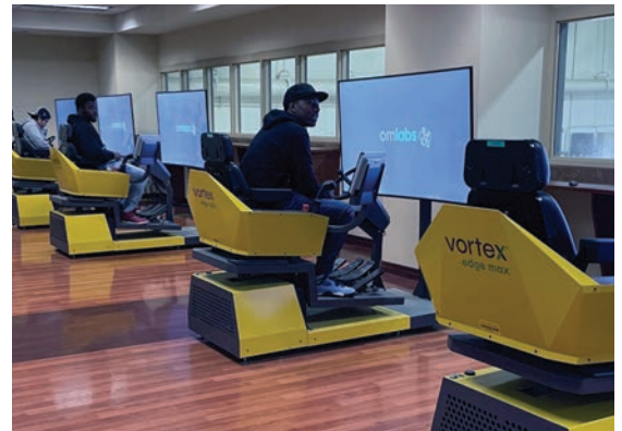
PHOTOS CLOCKWISE FROM LEFT: TRAINING SITE TOUR FOR UNITED ASSOCIATION (UA) PLUMBERS LOCAL UNION 210 / TRAINING SITE TOUR FOR INTERNATIONAL BROTHERHOOD OF ELECTRICAL WORKERS (IBEW) LOCAL UNION 697 ELECTRICIANS / TRAINING SITE TOUR FOR INTERNATIONAL UNION OF OPERATING ENGINEERS (IUOE) LOCAL UNION 150 HEAVY EQUIPMENT OPERATORS.