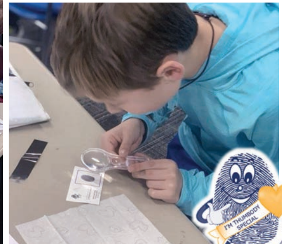
PHOTOS CLOCKWISE FROM TOP LEFT: MACARTHUR ELEMENTARY SCHOOL STUDENTS ENJOY THE I'M THUMBODY SPECIAL PRESENTATION IN THEIR CLASSROOM / STUDENTS PRESS THEIR THUMBPRINTS ON PAPER / USING A MAGNIFY GLASS, STUDENTS DISCOVER THE PATTERN IN THEIR THUMBPRINTS.