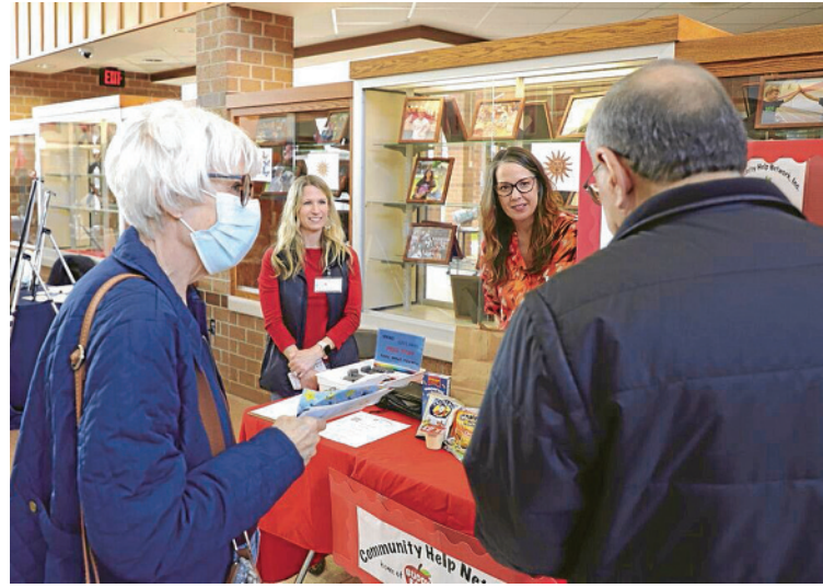
The Community Care Network strives to assist children and families who are food insecure.