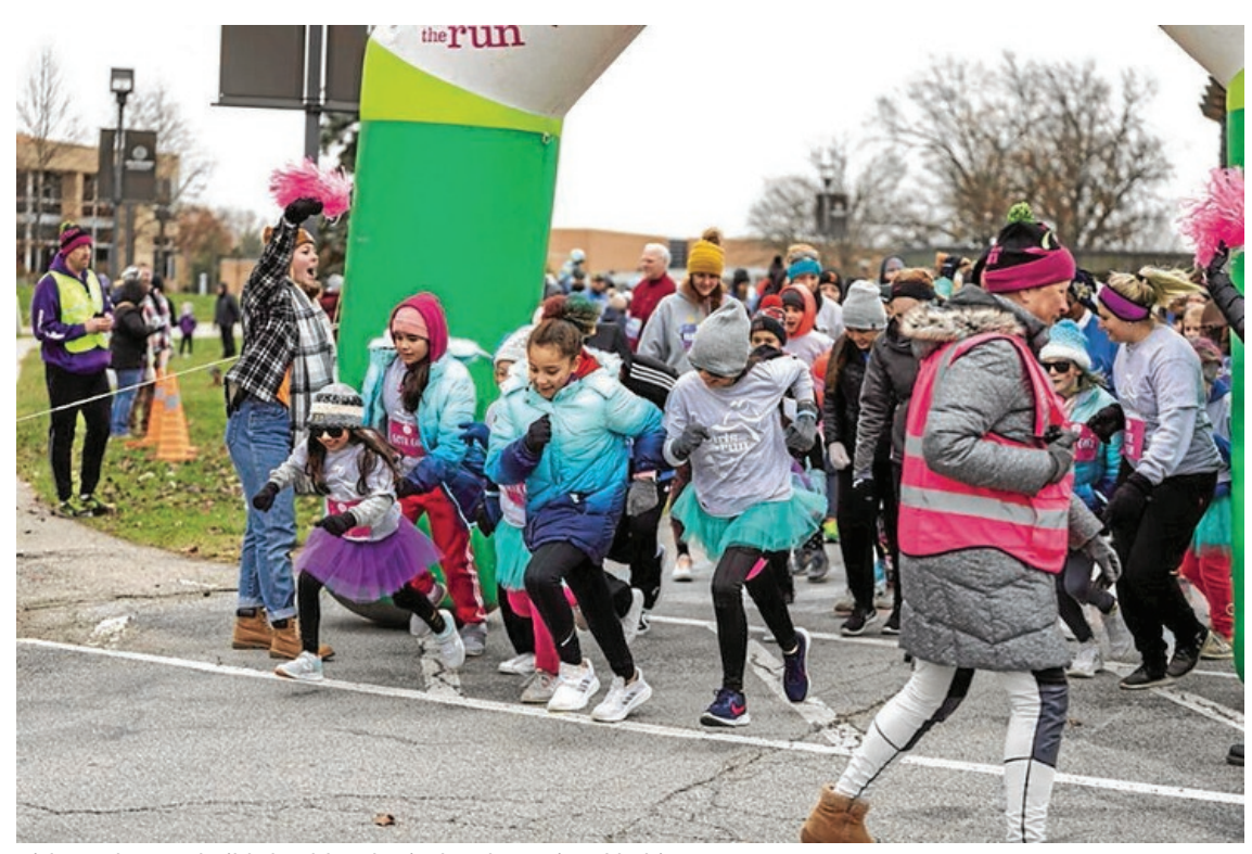
Girls on the Run builds healthy physical and emotional habits.