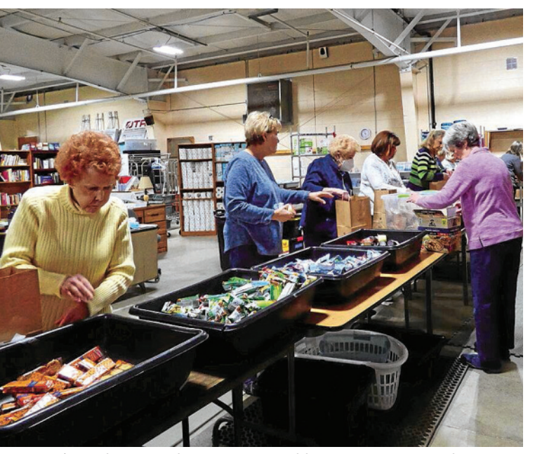
Community Help Network operates a Buddy Bags program and Household Pantry.