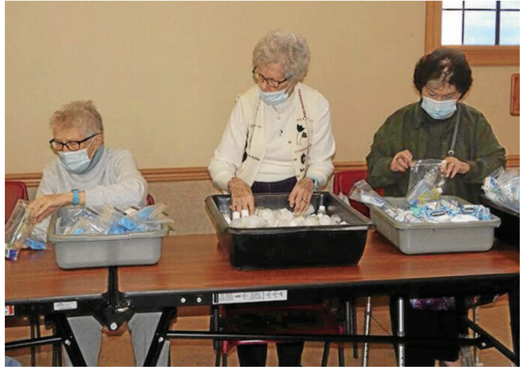
Community Help Network volunteers pack personal care items for those