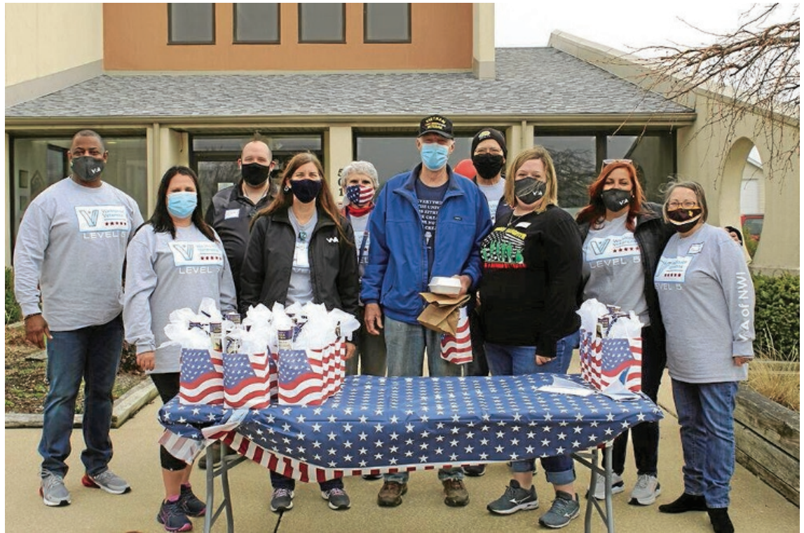
VNA Hospice of Northwest Indiana recruits veterans to work with patients.

we are excited about this opportunity the Crown Point Community Foundation is offering to local nonprofits. We are grateful for tion. the support they provide to local organizations, and how they are Community Help Network willing to work to connect us with