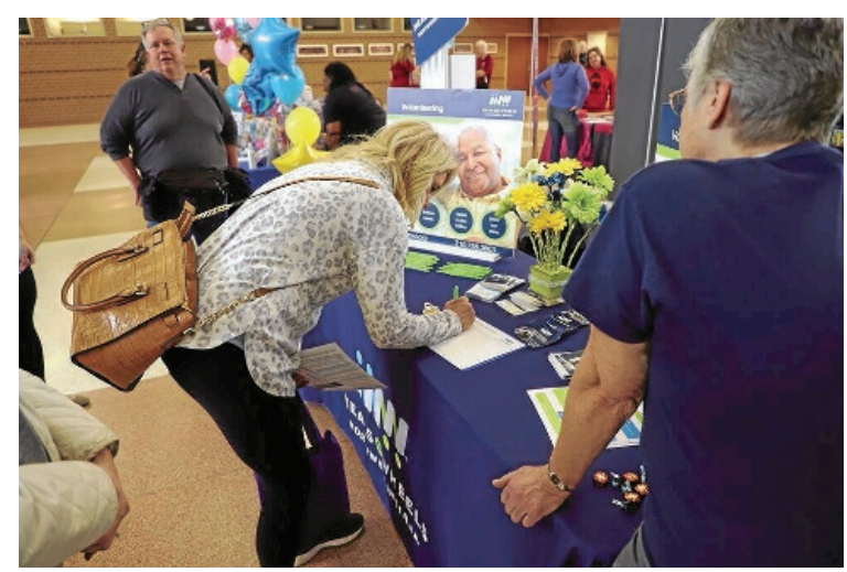
Meals on Wheels of Northwest Indiana seeks help with delivery as well as packing meals.