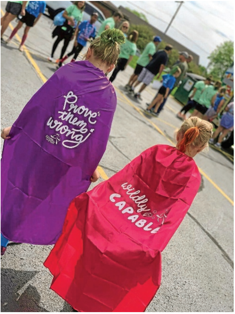
Girls on the Run in Northwest Indiana serves 10 counties and about 2,000 girls a year.

The organization began in 2017 by providing meals and snacks through the Buddy Bags program for food insecure students on the days they are not in school. "The program now serves over 850 school districts."