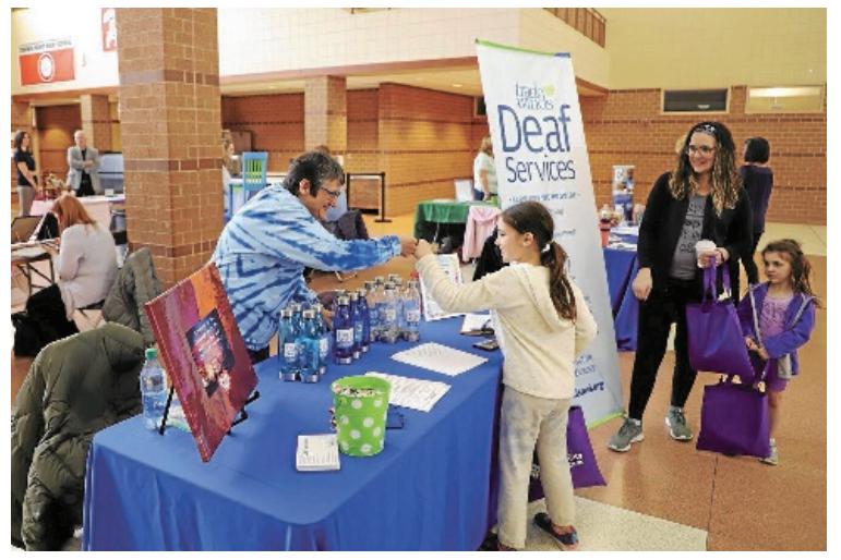
TradeWinds Deaf Services is among the nonprofits at the Fair.