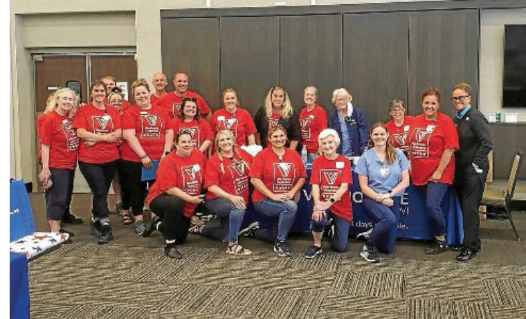
VNA Hospice volunteers are involved with everything from palliative care to Meals On Wheels in Porter County.

not been easy during COVID, so move our mission forward will Community Help Network. Help Network added a Household the pantry served an average of Pantry. "This program provides cleaning supplies, paper products and hygiene items to low-income families in South Lake County," says Meyer. "These are all things that cannot be purchased with students in 23 schools in four food stamps. This program has grown significantly in the last In January 2021, Community year. In the first quarter of 2022,