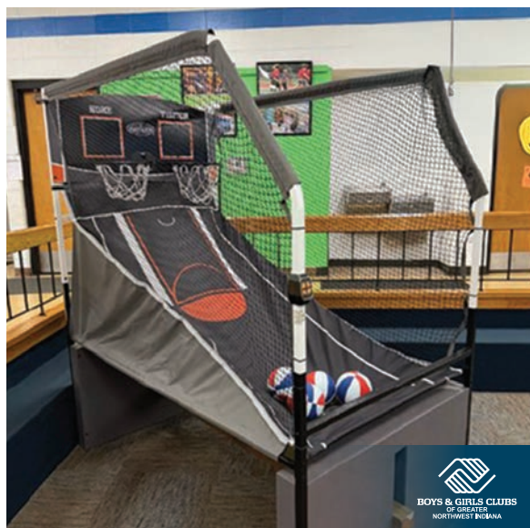
YOUTH AT THE CEDAR LAKE BOYS & GIRLS CLUB OF GREATER NORTHWEST INDIANA ENJOY REFRESHED SPACES - COMPLETE WITH NEW GAMES, CARPETING, AND FURNITURE.

to a stronger, more engaging out-of-school environment. A $7,500 CPCF grant was awarded to the Boys & Girls Clubs of Greater Northwest Indiana to help enhance the Cedar Lake Club with new games, carpeting, and furniture – improvements that strengthen programming, sustain engagement, and increase long-term impact for area youth.