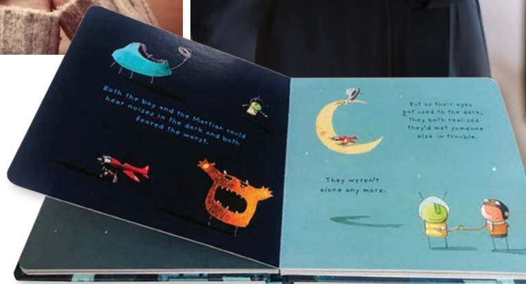
The Way Back Home by Oliver Jeffers

STORYBOOK STEM ADVENTURES ENHANCE EDUCATIONAL OPPORTUNITIES, INSPIRE CREATIVITY, AND EMPOWER CHILDREN WITH CRITICAL THINKING SKILLS THAT WILL BENEFIT THEM BEYOND THE CLASSROOM.