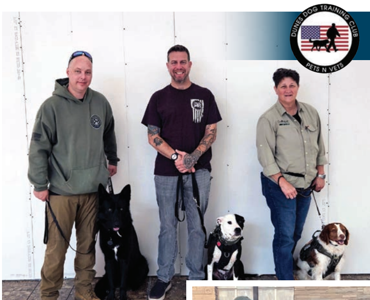
VETERANS AND THEIR DOGS TRAIN TOGETHER IN THE PETS N VETS PROGRAM TO BUILD SKILLS FOR COMPANIONSHIP, EMOTIONAL SUPPORT, THERAPY, AND SERVICE WORK.

American Kennel Club (AKC) standards, guiding them through levels such as AKC STAR Puppy, Canine Good Citizen, Community Canine, and Urban Canine Good Citizen. For Veterans with disabilities who may benefit from service dog tasks, the program also provides instruction on Public Access Test requirements and the skills needed to train a qualified service dog.