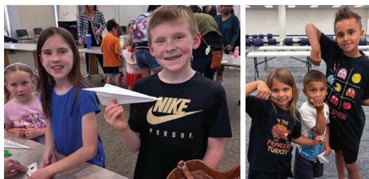
STUDENTS BRING STORIES TO LIFE THROUGH IMAGINATION AND PROBLEM-SOLVING DURING STORYBOOK STEM ADVENTURES.