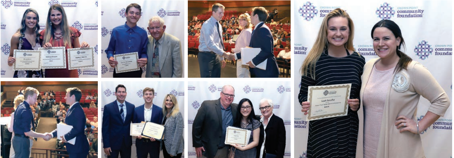
^ ALL IMAGES ON THIS PAGE ARE FROM THE 2019 CPHS SCHOLARSHIP AWARDS NIGHT.